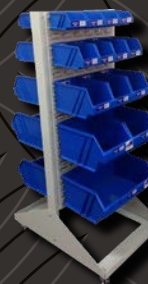
Mobile Feeder Trolley