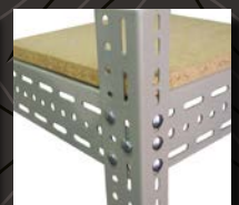
Heavy: 90mm x 40mm