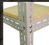
Medium: 60mm x 40mm