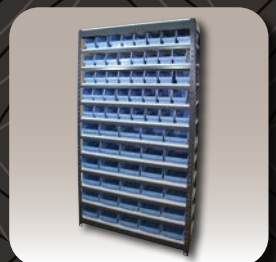
Rivet Bin Shelving