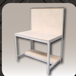
Handy Angle Workbench