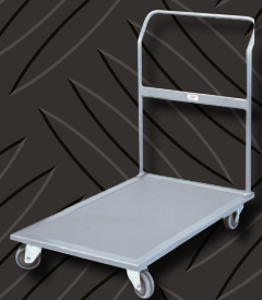
Flat Bed Trolley