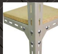
Light: 40mm x 40mm